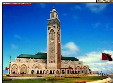
Hassan II Mosque