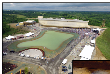
The Ark Encounter